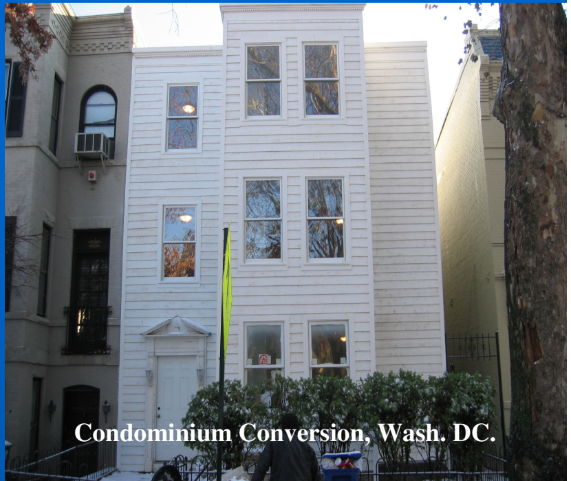
Condominium Conversion, Wash. DC.