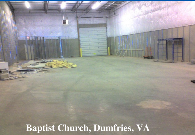
Baptist Church, Dumfries, VA